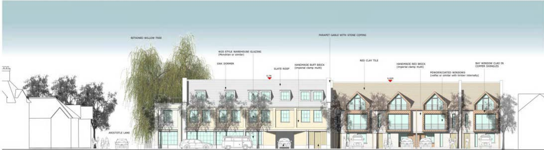
EAST ELEVATION - STREET ASPECT FROM HAYFIELD ROAD