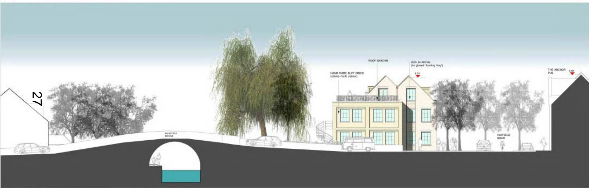
Proposed East-West Section