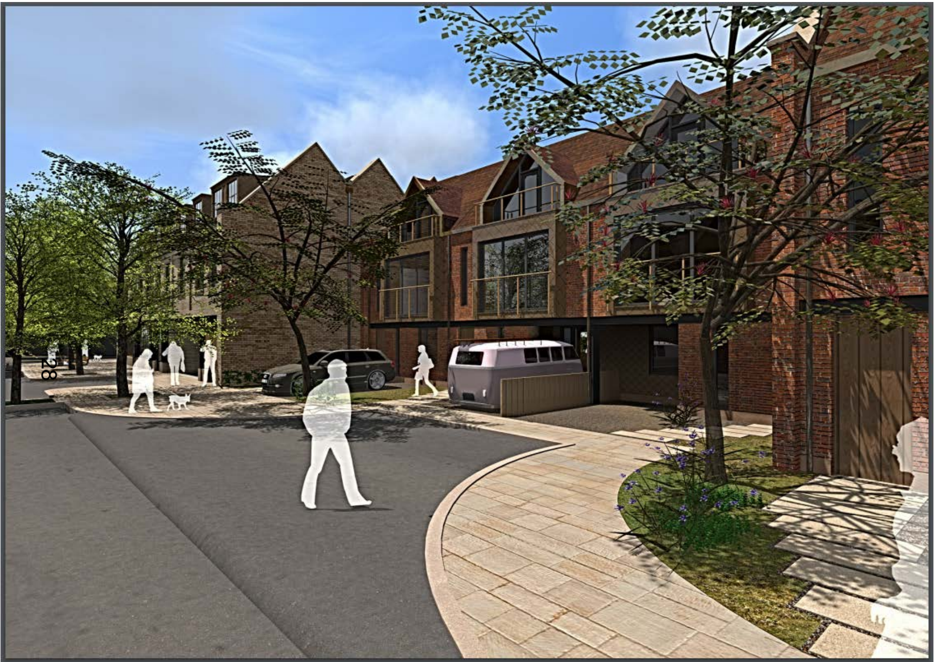
Hayfield Road Frontage