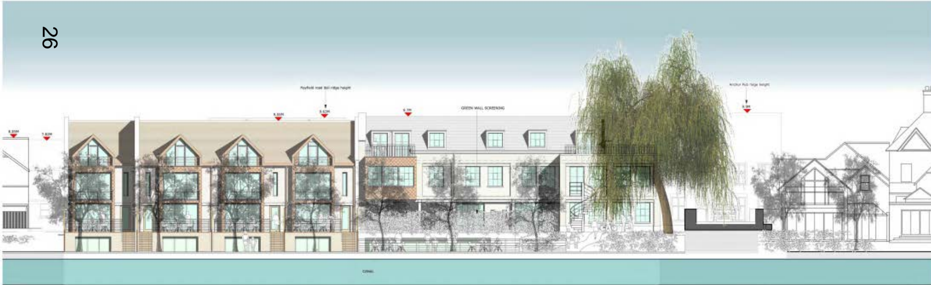
WEST ELEVATION - CANALSIDE ASPECT