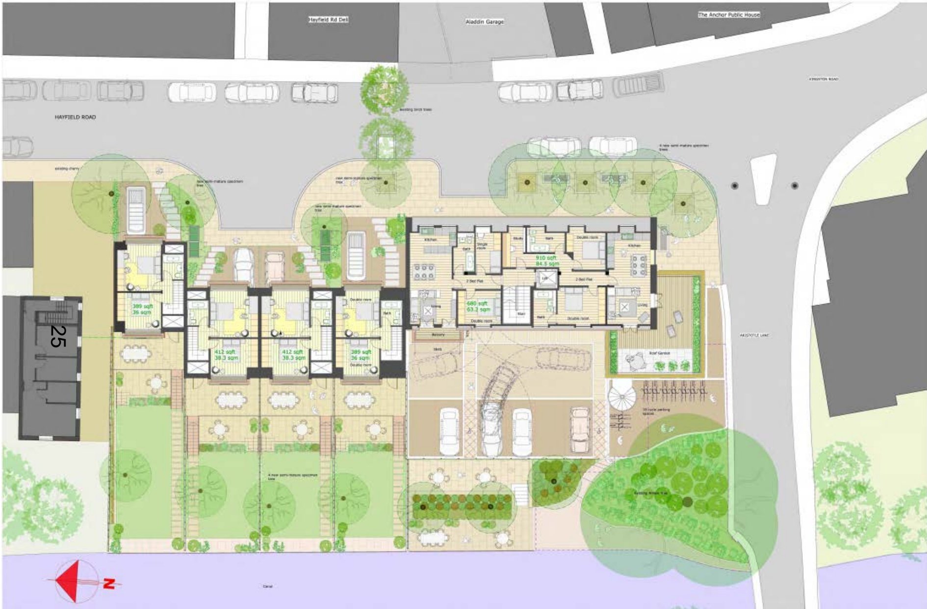
Proposed Second Floor Plan